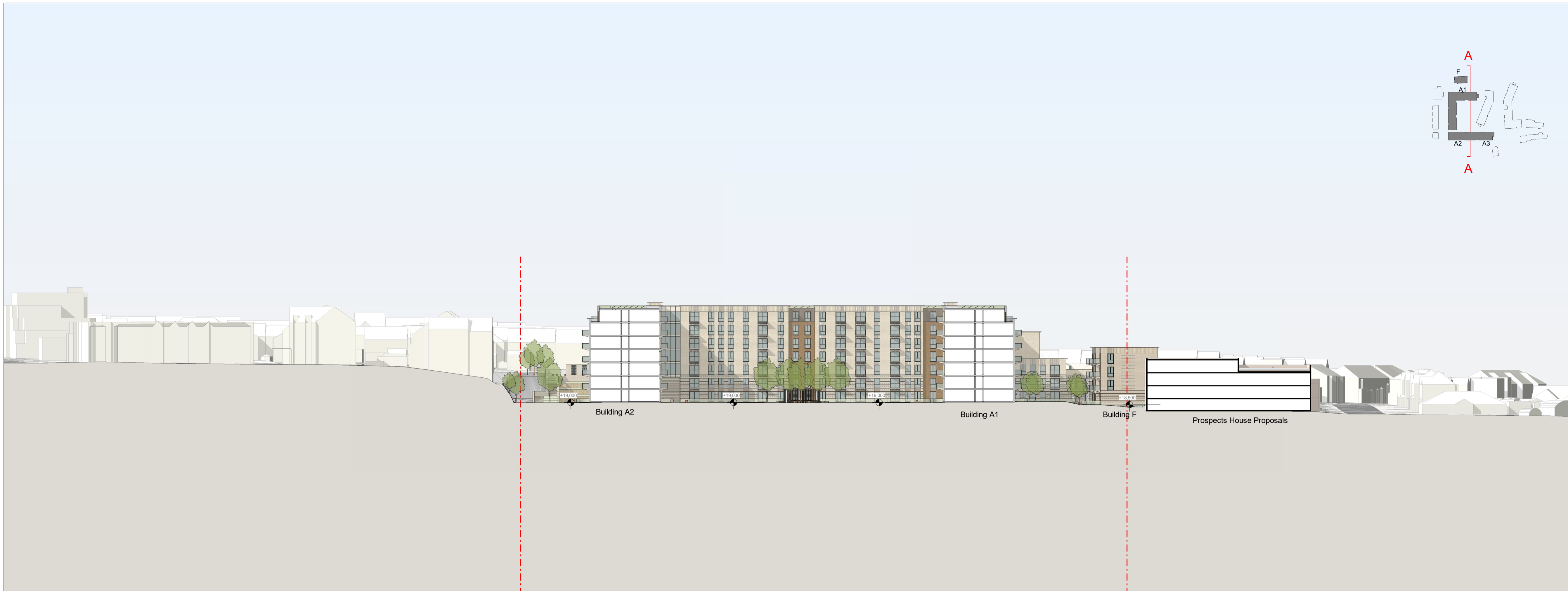
1 Elevation A'A 1:500