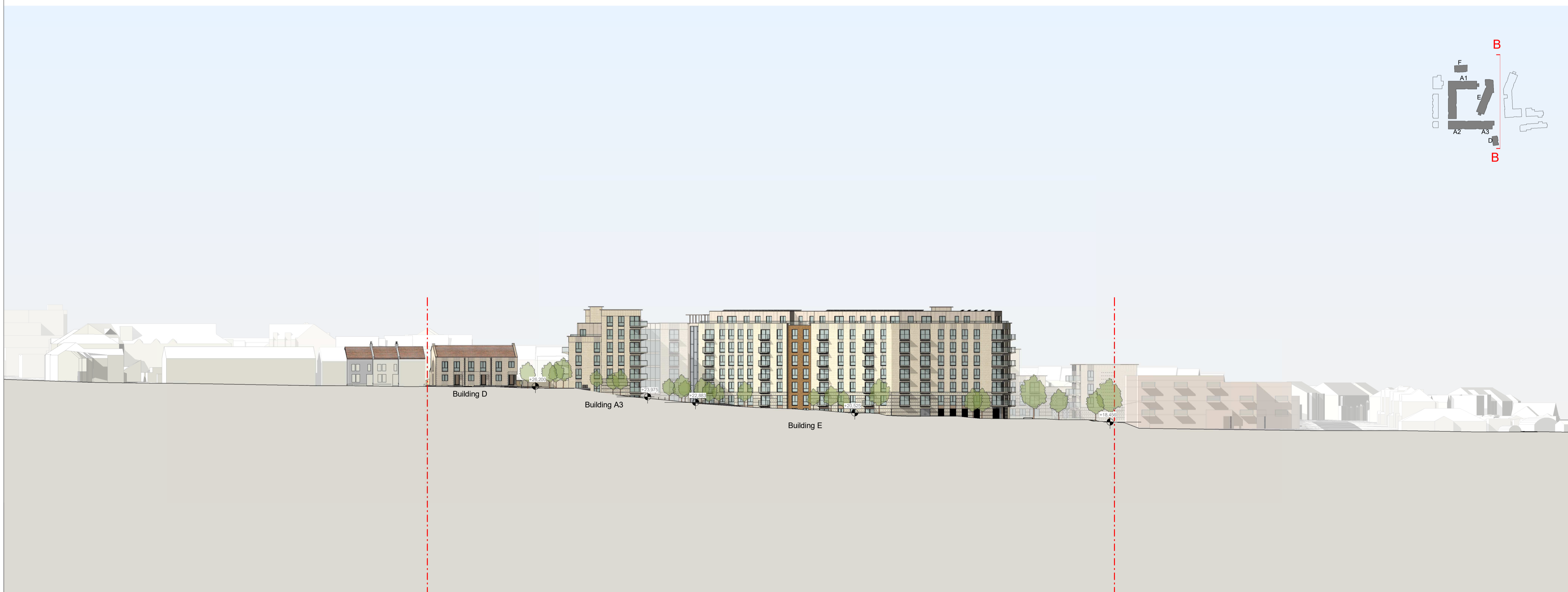
2 Elevation B'B 1:500